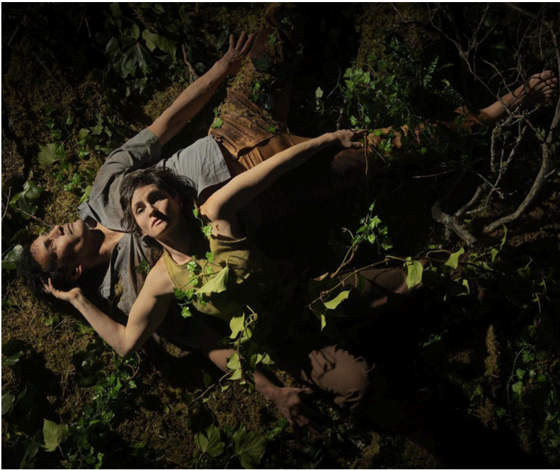
(L-R)